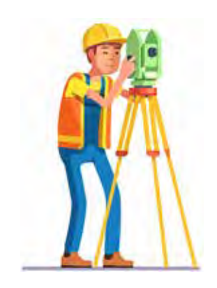
Continued on next page...