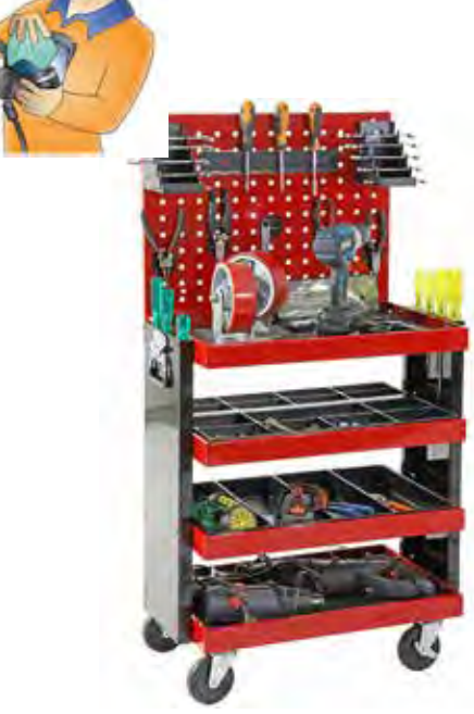
Continued on next page...

Choose cases that are appropriate for the size and shape of the tools, and ensure they are securely closed or latched.